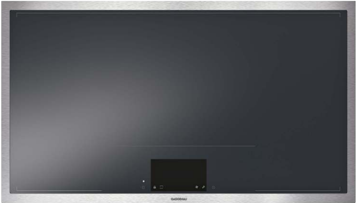
GAGGENAU VARIO 400 SERIES FULL SURFACE INDUCTION COOKTOP.