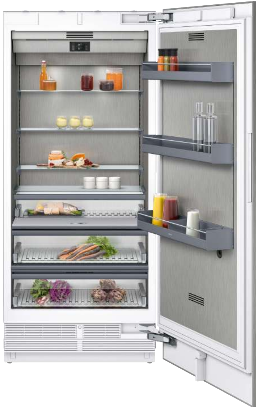
GAGGENAU 400 SERIES REFRIGERATOR COLUMN.