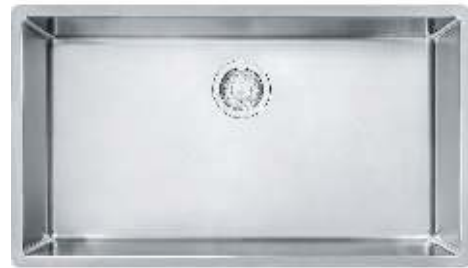
FRANKE - MODEL #CUX11030 / #CUX11027 / #CUX11021