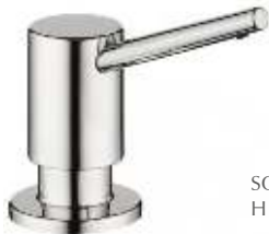
SOAP DISPENSER HANSGROHE H 04539000