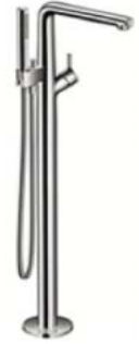
HANSGROHE FREESTANDING TAIL S 72412001