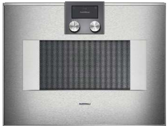
GAGGENAU BM 450