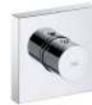
AXOR STARCK THERMOSTAT AX10755001

- AXOR - Form follows perfection. This sentence represents AXOR. Perfection in all its dimensions. In the design. In the technology. In every innovation. In every detail. AXOR'S goal is to finish products off to perfection. The development process continues until there's nothing left to be added or removed. Until the product is more than the combination of form and function.