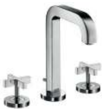
AXOR CITTERIO 39135001