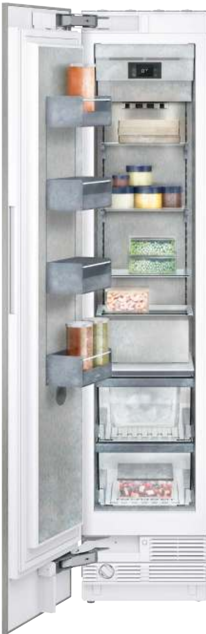
GAGGENAU 400 SERIES FREEZER COLUMN.