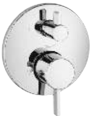
HANSGROHE S THERMOSTATIC TRIM H04231000

• Ecostat Thermostatic trim S with Volume Control and Diverter. Select your shower pleasure, intuitive operation at the touch of a button: one click is all it takes to change the spray mode, activate another shower or turn the water on and off.