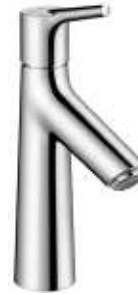
HANSGROHE TALIS S 100 HANDLE W/POP-UP H72020001