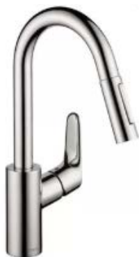
HANSGROHE FOCUS FAUCET H 04505000