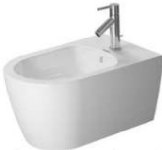
DURAVIT ME BY STARCK 2288150000