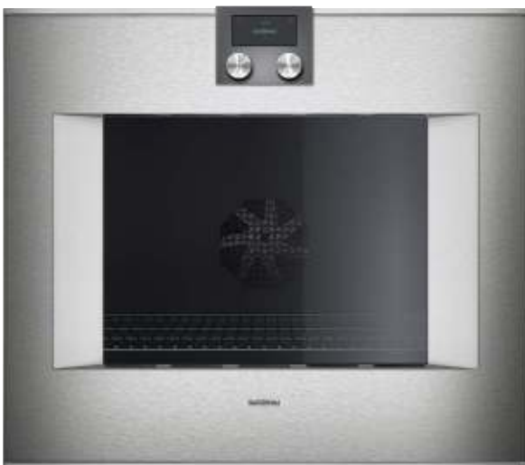
GAGGENAU BO400 SINGLE - OVEN