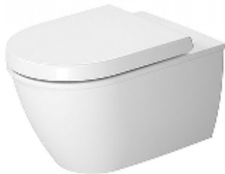
DURAVIT ME BY STARCK 2529090092