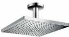
HANSGROHE RAD E 300 SHOWER 26240001

- AXOR Citterio combines the best in one collection. Corners, edges and a distinctive flat design. These set the stage for the light, to be perfectly reflected. Projecting radii. Precisely worked out. These references transform the collection into a masterpiece of the neoclassicism of the 1930s. And ensure that it looks monumental on the sink. Perfection, design by Antonio Citterio